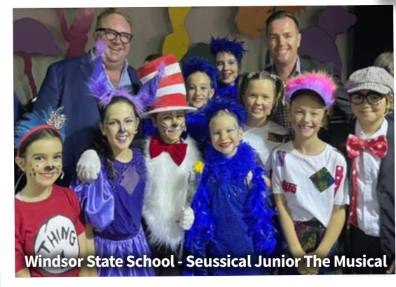
Windsor State School - Seussical Junior The Musical