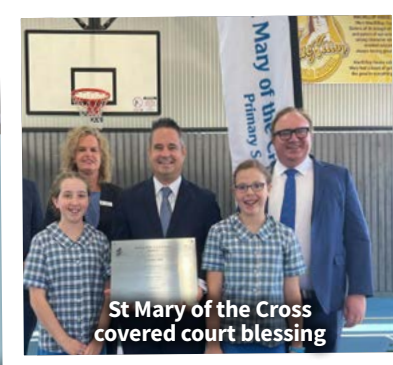
St Mary of the Cross Primary School covered court blessing