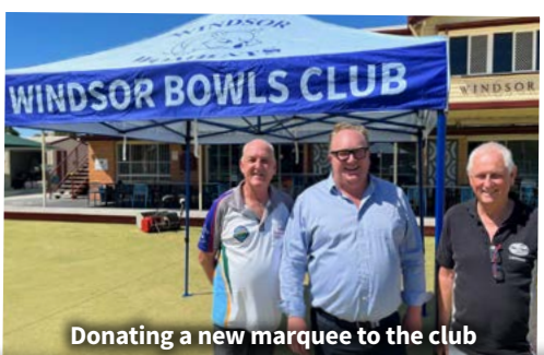
Donating a new marquee to the club