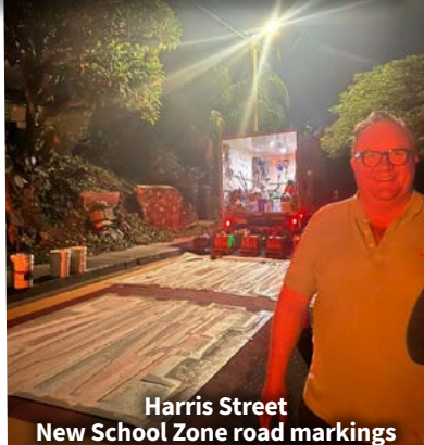
Harris Street New School Zone road markings