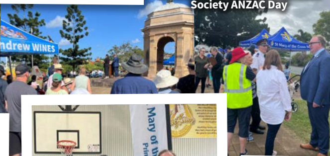
Windsor and Districts Historical Society ANZAC Day