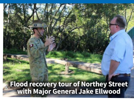
Flood recovery tour of Northey Street with Major General Jake Ellwood