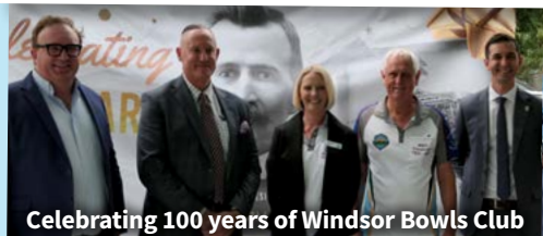
Celebrating 100 years of Windsor Bowls Club