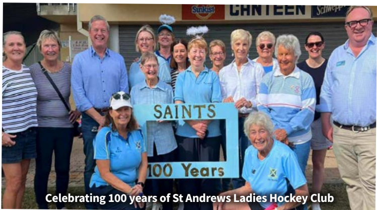
Celebrating 100 years of St Andrews Ladies Hockey Club