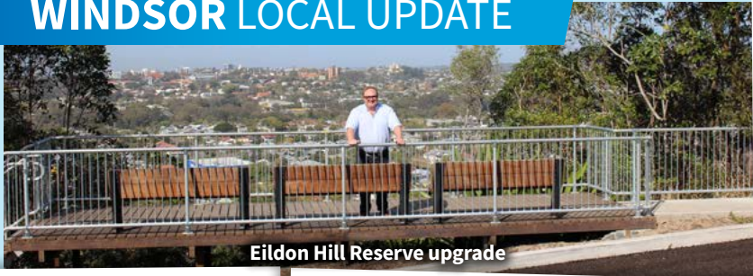
Eildon Hill Reserve upgrade